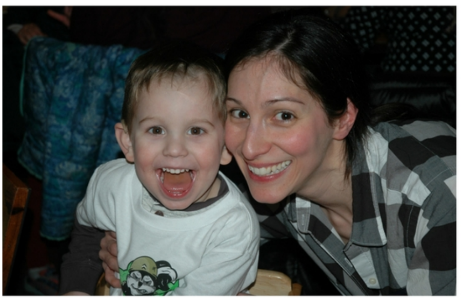
2 Mill & Main Place, Suite 418, Maynard, MA 01754 www.decibelsfoundation.org